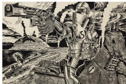
2. Baron Kindai Goshu Maro in Iwo Jima , woodcut print (panel, Japanese paper, oil ink), 2017 Photo: MIYAJIMA Kei © KAZAMA Sachiko, Courtesy of MUJIN-TO Production