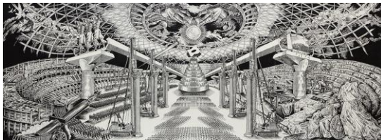
1. Dyslympics 2680 , woodcut print (Japanese paper, oil ink), 2018

Award: The 8th 'Tradition créatrice' Art Award, Japan Arts Foundation, 2016.