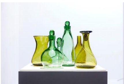
3. Floating monuments , glasses, mixed media, 2015-

Award: Gwangju Biennale, Noon Award (Emerging Artist). He has also been selected to represent Japan in the Japan Pavilion at the 58th Venice Biennale in 2019.