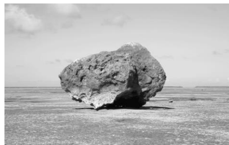
4. Tsunami Boulder , video, 2015-