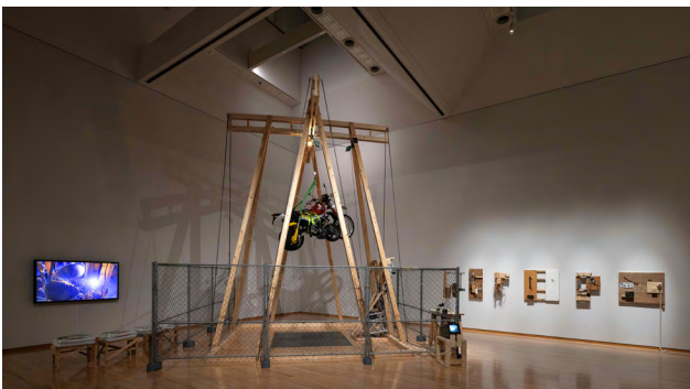
3. TEFCO vol.2 ~Under Control~ , 2023, installation view at "MOT Annual 2023 Synergies, or between creation and generation," Museum of Contemporary Art Tokyo

Awards: "TERRADA ART AWARD 2023," TERASE Yuki Award, "The 21th Japan Media Arts Festival," Art Division, Excellence Award, 2018 (*With KANNO So) and more.