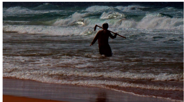
2. Cultivating the Waves , 2024, single channel video

An interview with award winners, their future activities and the detail of the exhibition will be published on the TCAA website.