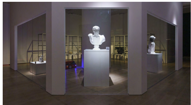
4. Installation in Progress , 2022, installation view at "Roppongi Crossing 2022: Coming & Going," Mori Art Museum, Tokyo

An interview with award winners, their future activities and the detail of the exhibition will be published on the TCAA website.