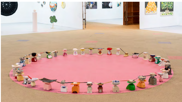
1. The Weight Between You and Me , 2023, installation view at "BEYOND GLITCH : Remapping Reality in a Broken World," Kyoto International Conference Center, 2023

Awards: "The 36th Takashimaya Art Award," 2025, "Nissan Art Award 2020," Grand prize