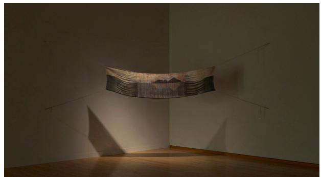
6. OH Haji Nautical Map , 2017