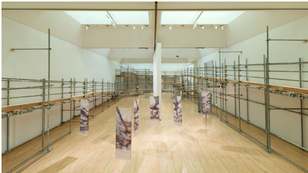
1. Installation view at "Tokyo Contemporary Art Award 2024-2026 Exhibition 'Wetland'," Museum of Contemporary Art Tokyo, 2025