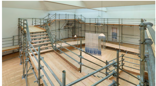
2. Installation view at "Tokyo Contemporary Art Award 2024-2026 Exhibition 'Wetland'," Museum of Contemporary Art Tokyo, 2025