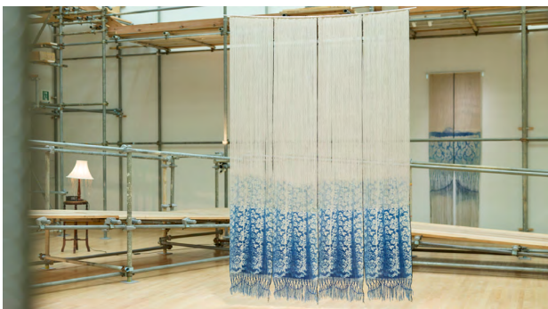
7. OH Haji A House of Memory Traces , 2019