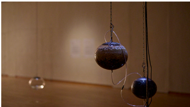
3. UMEDA Tetsuya Watering , 2025