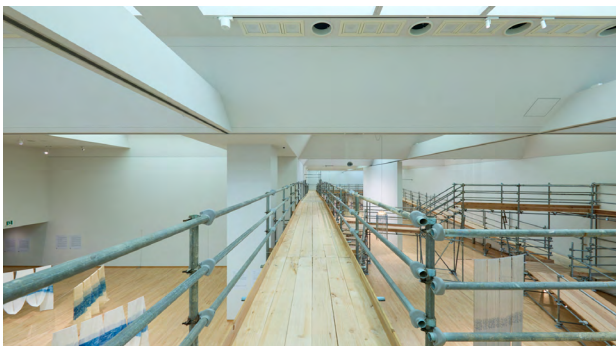
5. UMEDA Tetsuya Watering , 2025