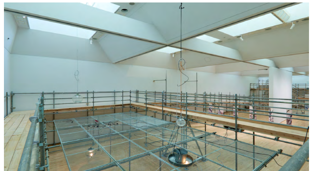
4. UMEDA Tetsuya Watering , 2025