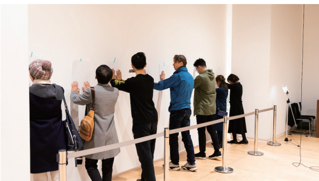
3. Installation view at "On the origin of voices," Fukuoka Art Museum, 2019