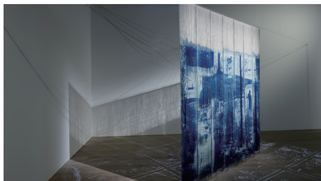
5. Seabird Habitats , 2022, installation view at "Roppongi Crossing 2022: Coming & Going," Mori Art Museum, Tokyo

Recent exhibitions: "KANTEN 観展 : The Limits of History," Apexart, New York, 2023, "Roppongi Crossing 2022, Coming & Going," Mori Art Museum, Tokyo, "Publicness of the Art Center phase II," Contemporary Art Gallery, Art Tower of Mito, 2019, Solo Exhibition "Memories in Weaving," Kurumaya Museum of Art, Oyama City, Tochigi, 2019, "Binding threads/ Expanding threads: The art of creating 'Between-ness'," Hiroshima City Museum of Contemporary Art, 2017, Solo Exhibition "The imaginary landscape- grandmother island," MATSUO MEGUMI +VOICE GALLERY pfs/w, Kyoto, 2017, and more.