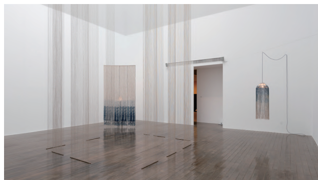
6. A House of Memory Traces , 2019