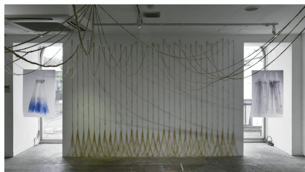
8. Wearing Memory , 2014