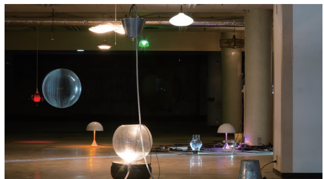
4. Things that don't know , 2017, installation view at "Sapporo International Art Festival 2017," Kinichikan Bldg.