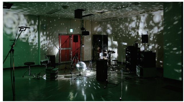
2. Floor 0 , 2020, installation view at "Saitama Triennale 2020," Former Omiya ward office