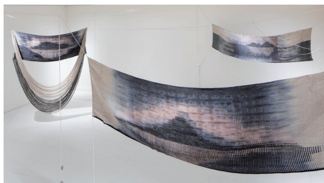
7. Nautical Map, 2017-2019