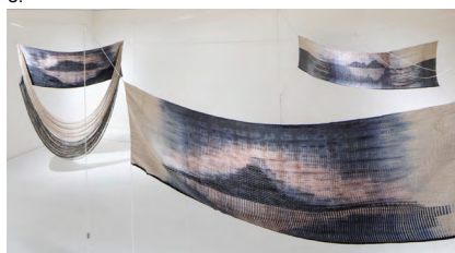
8. Wearing Memory , 2014