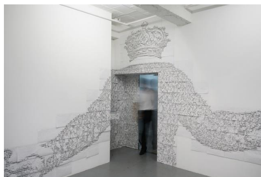
4. Document 1: Corona and Body , 2020 installation, laser print on papers