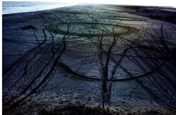
2. rasen kaigan 31 , 2019, C-type print at "RASEN KAIGAN," Sendai Mediatheque 6th floor gallery, 2012-2013