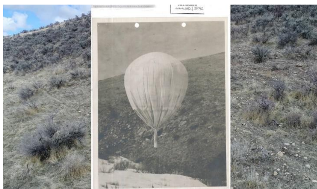
3. Blind Bombing, Filmed by a Bat , 2019-2020 single-channel digital video with sound, 32min