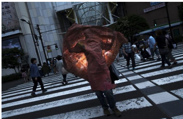
1. Today is the same as yesterday; tomorrow will be the same as today , 2019, C-type print at "Human Spring," Tokyo Photographic Art Museum, 2019

Awards: "The 33rd Kimura Ihei Award," 2007, "ICP Infinity Award," 2009.