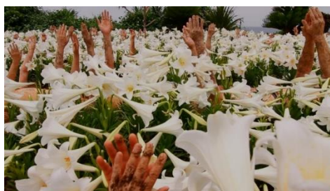
4. Mud Man , 2016, 3-channel high-definition video installation