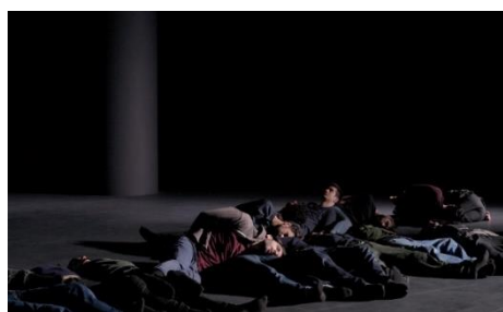
2. The Primary Fact , 2018