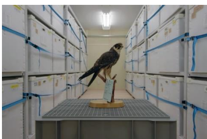
1. Les nucléaires et les choses , 2019

Award: "Nissan Art Award 2017," Grand Prize.