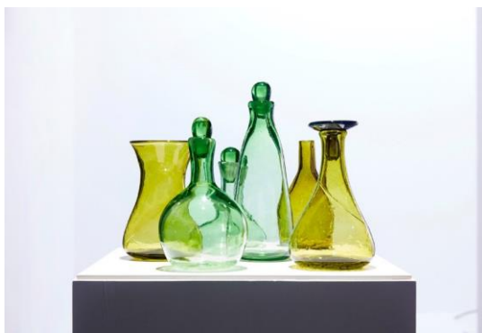
3. Floating monuments 2015-, glasses, mixed media

Recent exhibitions: "Time' in contemporary art," Takamatsu Art Museum, Kagawa, 2020, Solo Exhibition "Floating Monuments," Ohara museum of art / Yurinso, Okayama, 2019, "Cosmo-Eggs," The Japan Pavilion at the 58th International Art Exhibition, La Biennale di Venezia, 2019, "MOVING STONES," KADIST, Paris, 2018 etc.