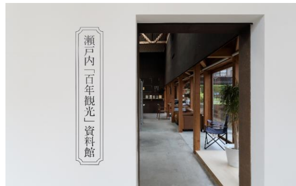
4. Setouchi "100 Years Tourism" Museum 2020